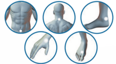
• Patented form of phototherapy