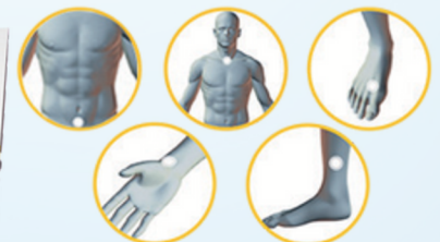
• Patented form of phototherapy