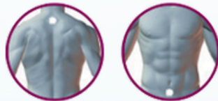
• Patented form of phototherapy